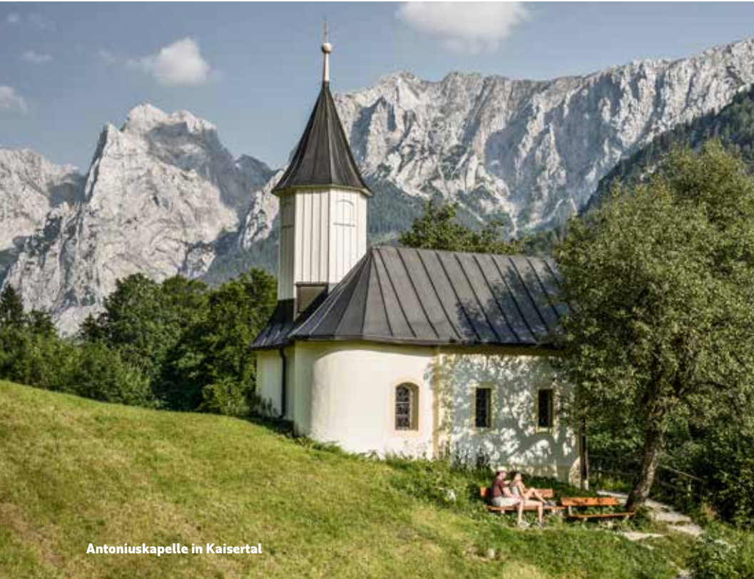
Antoniuskapelle in Kaisertal