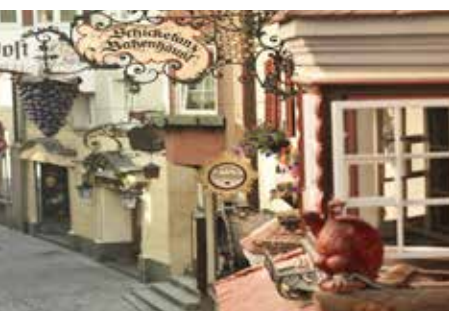
Old town Kufstein