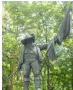
Andreas Hofer monument