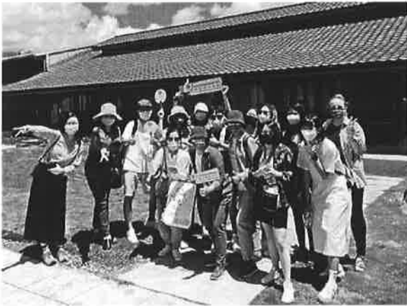
A field trip to the Chishang Art Center, Taitung in August 2022.