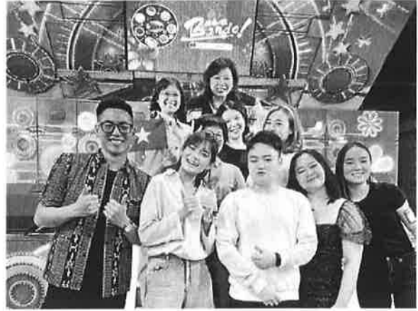
PTS World Taiwan invited the international students of GCIT for the Spring "Bando" Party in March 2022.