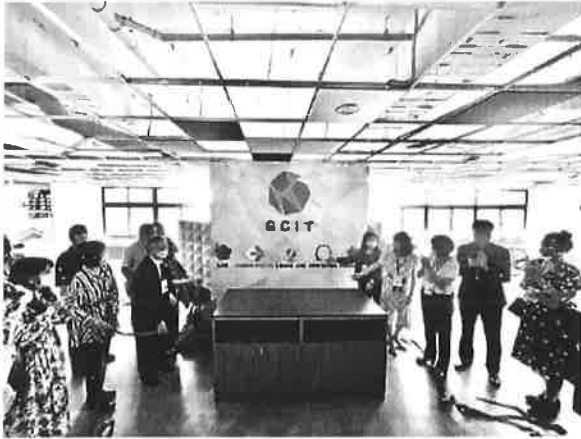
The unveiling ceremony of GCIT in June 2022.