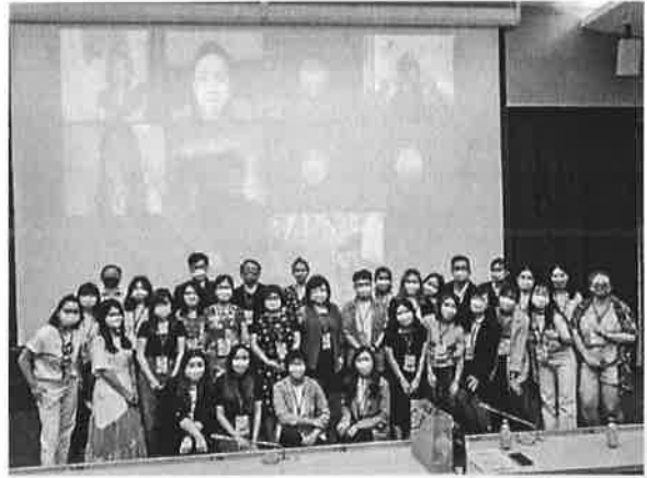
GCIT 2022 meet-up party for faculty and students in June 2022.