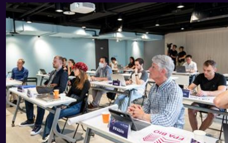
Lectures & workshops