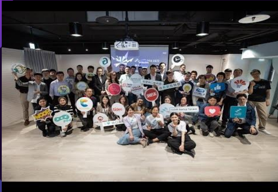
2023 Softlanding & FLASH Program (March) Recap @YouTube