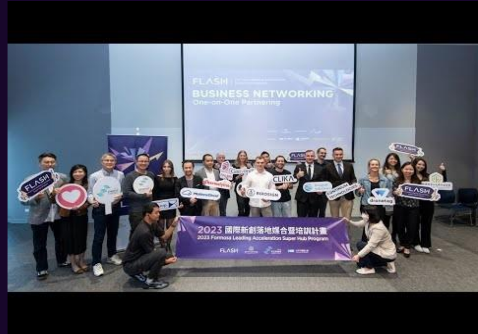
2023 Startup Terrace FLASH Program (OCT-NOV) Recap @YouTube