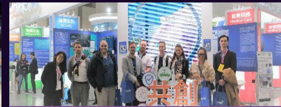
Smart City Summit & Expo (SCSE)