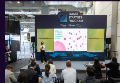
ST Day Pitch Show