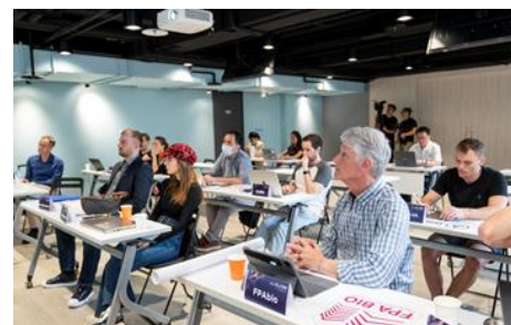
Lectures & workshops