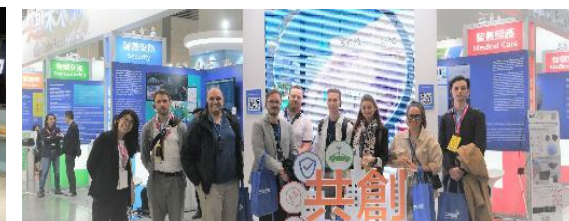
Smart City Summit & Expo (SCSE)