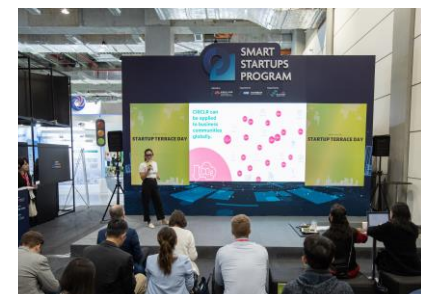
ST Day Pitch Show