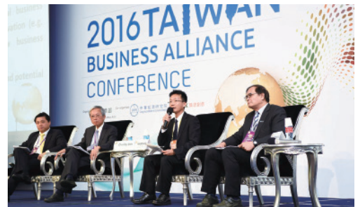
▲ Panel Discussion: The development of Taiwan's emerging industries, and associated investment opportunities