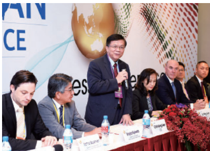
▲ Minister Lee Chih-Kung offered opening remarks at the press conference

Representatives from leading foreign enterprises investing in Taiwan were invited to exchange Letters of Intent (LOIs) with the Minister of Economic Affairs at past Conferences. These enterprises, including Air Products (US), Dong Energy (Denmark), General Electric (US), Hitachi-High Technologies (Japan), H&M (Sweden), and Mitsui & Co. (Japan), expressed strong intention of investing or expanding operations in Taiwan.