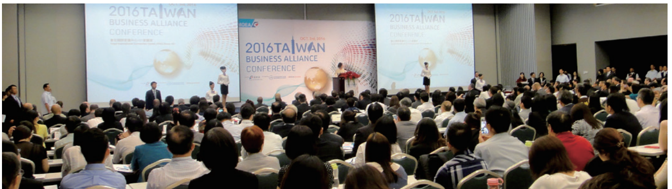
▲ The 2016 Taiwan Business Alliance Conference