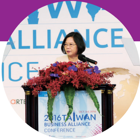
▲ President Tsai Ing-wen presenting her welcome remarks

Focusing on the Taiwanese government’s latest economic policies along with the associated investment opportunities, the Conference sets its main theme and serves as a platform for collaboration between the public and private sectors. The Conference will also help business managers, industrial experts, and venture investors to learn more about Taiwan’s advantages, environments, and investment opportunities, so as to foster the investment ties and partnerships.