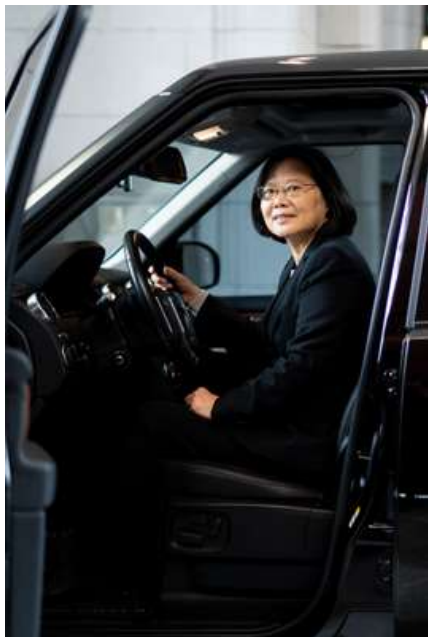
In the driving seat