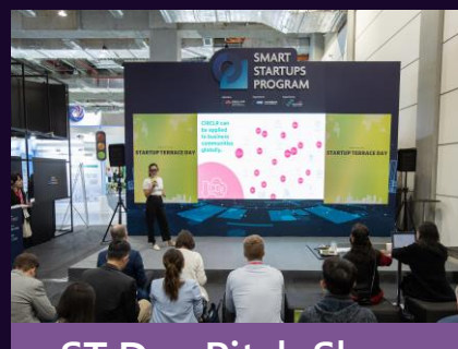
ST Day Pitch Show