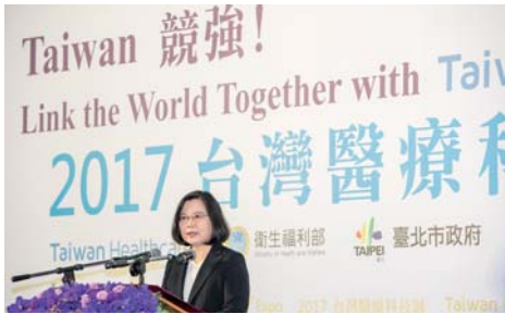
President Ing-Wen Tsai

◆ The inaugural Taiwan Healthcare+ Expo showcasing the entire health industry attracts government support!