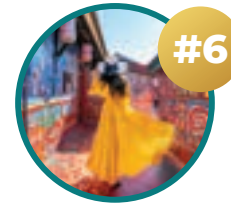
Culture & Welcome