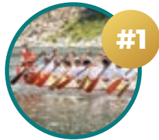
Health & Well-Being