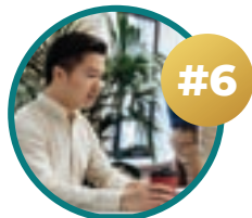
Salary & Job Security