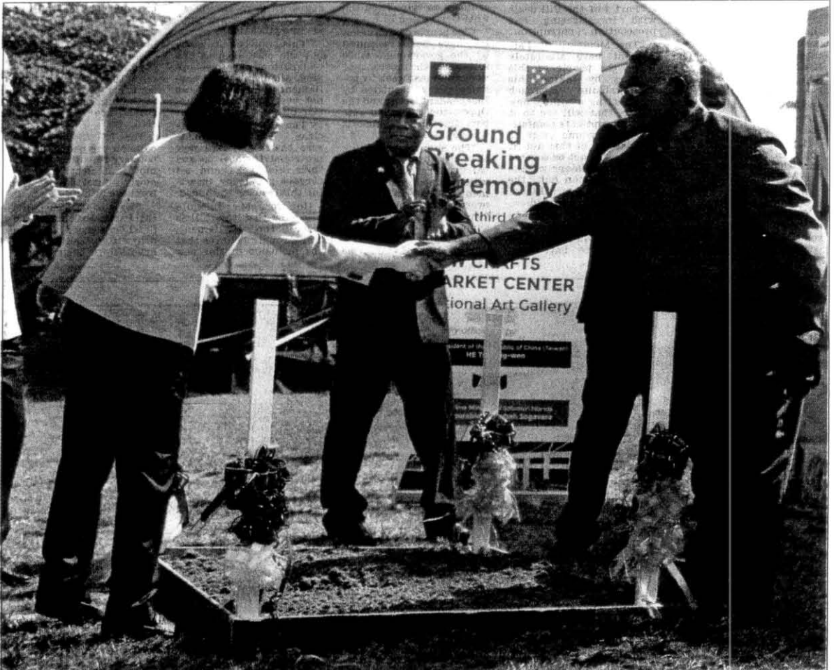
Prime Minister Manasseh Sogavare and President Tsai Ing-Wen shakes hands after ground breaking ceremony for an Art Crafts Market Centre to be funded by Taiwan.

President Ing-wen and her 131-member delegation left yesterday after a two-day visit in Honiara.