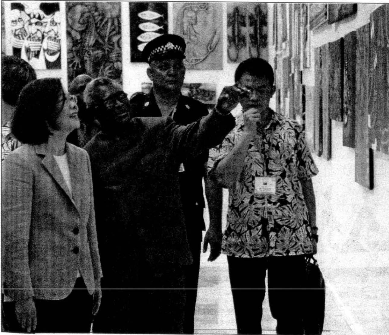
Prime Minister Manasseh Sogavare and President Tsai Ing-Wen looking at the arts.