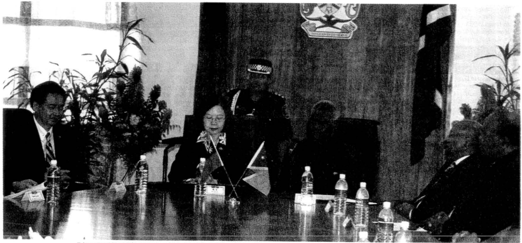
Taiwan President Tsai Ing-wen and Solomon Islands Prime Minister Manasseh Sogavare during the bilateral meeting this week.

The agreement paves a way forward for airlines from both countries to enter into code-sharing agreement allowing passengers access to frequent