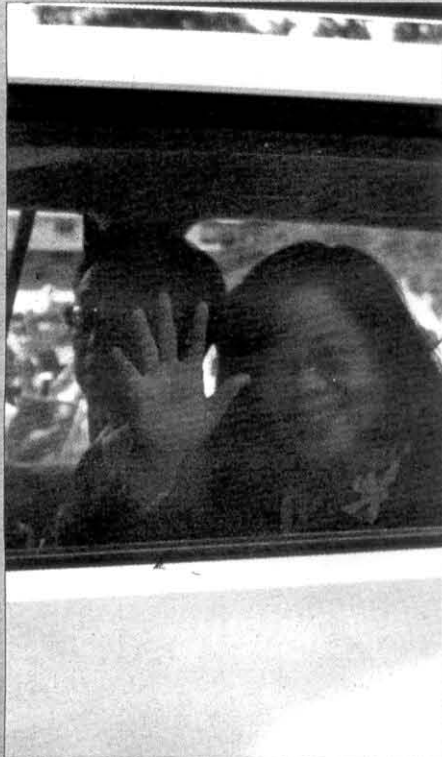
Taiwan President Tsai Ing-wen waves to members of the public this week in Honiara. PM Sogavare said Taiwan is a true friend of Solomon Islands.