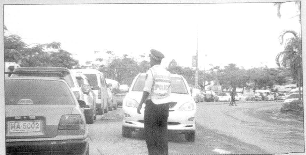
Traffic officer observing busy traffic jam during ROC-Taiwanese President