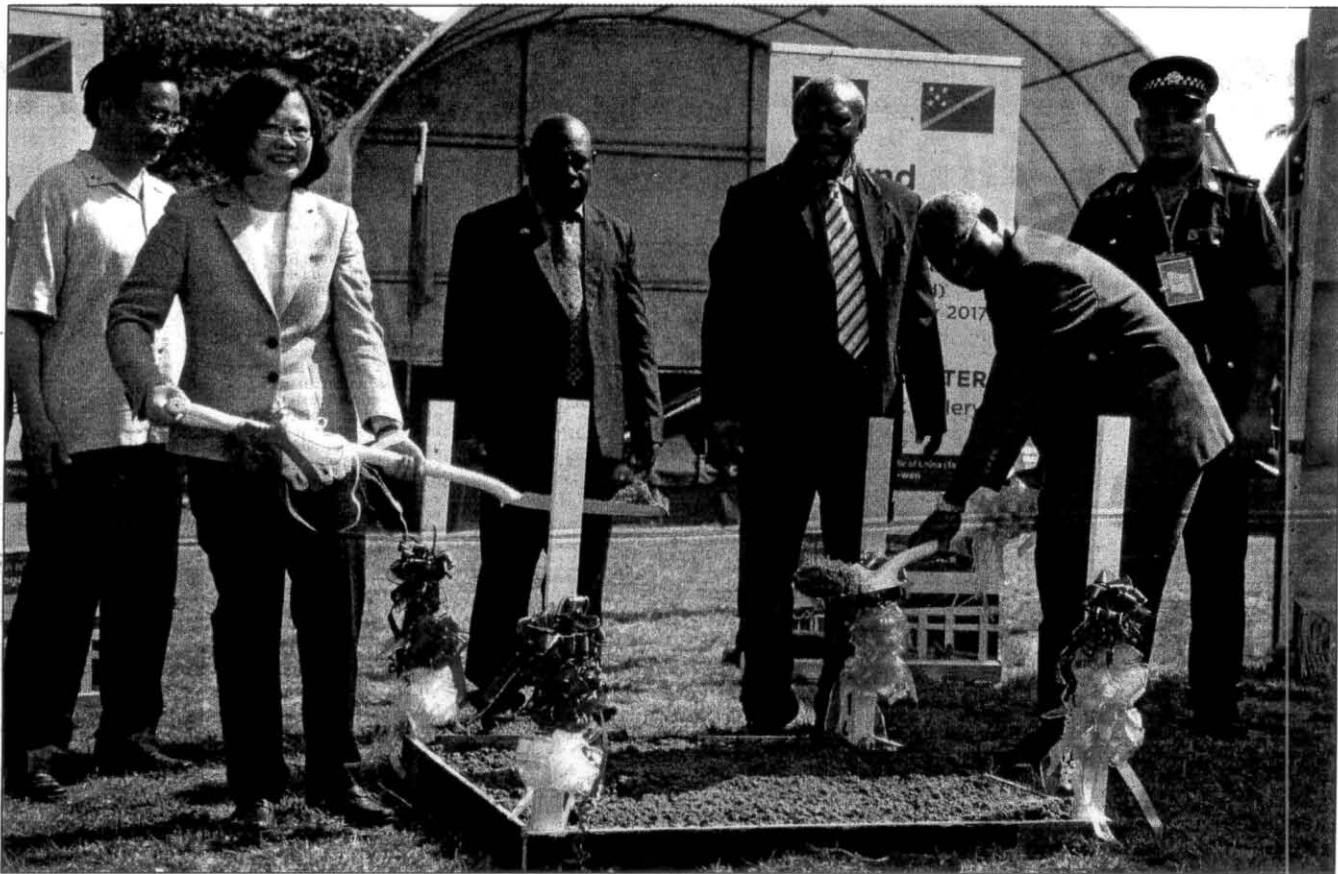
Prime Minister Manasseh Sogavare and President Tsai Ing-Wen officially conducting the ground breaking at the National Art Gallery.