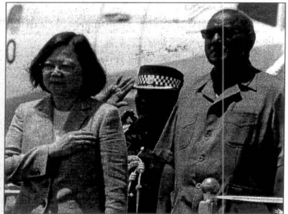
President Tsai Ing-Wen, Minister for Foreign Affairs and External Trade Milner Tozaka on the Salute Dais.