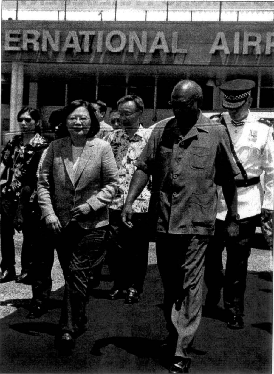
President Tsai Ing-Wen upon arrival for departure.