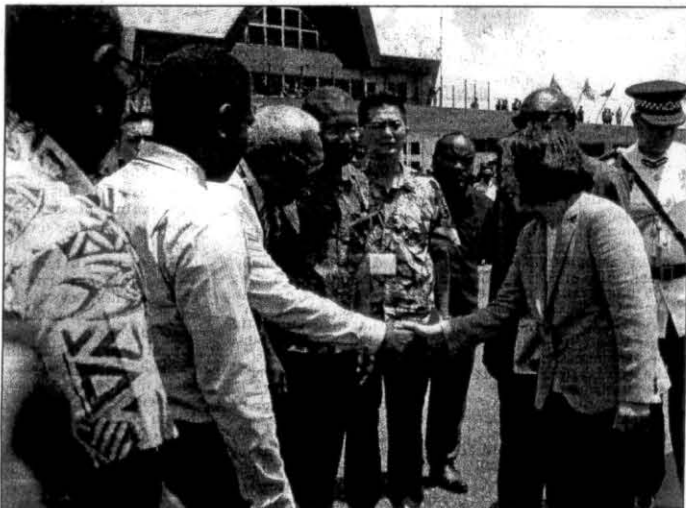
President Tsai Ing-Wen farewelled by Government Officials.