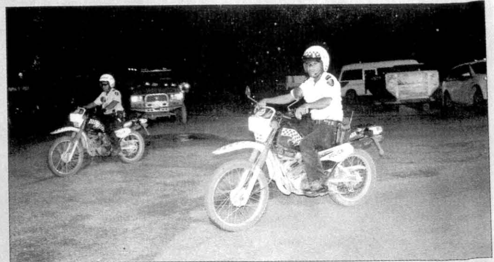
RSIPF provided escort for ROC-Taiwanese President Visit.