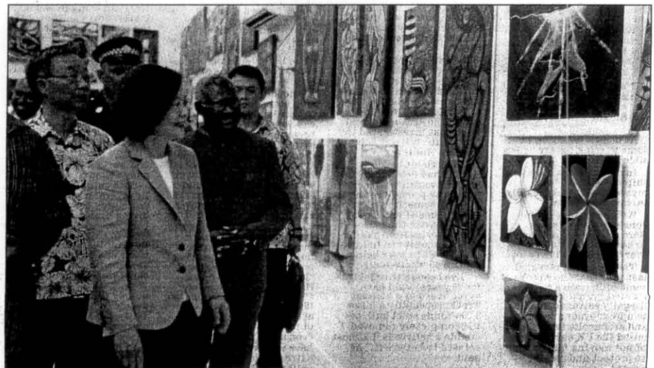
Prime Minister Manasseh Sogavare and President Tsai Ing-Wen looking at some of the paintings in the Art Gallery