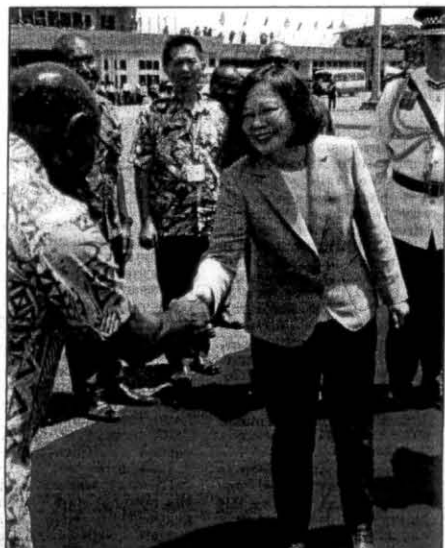
President Tsai Ing-Wen shakes hands with Solomon Islands Ambassador to Taiwan.