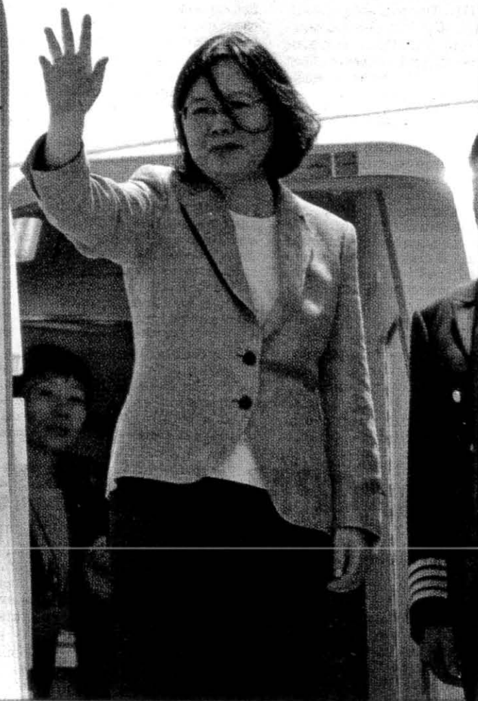
Taiwan President Dr Tsai Ing-wen waves goodbye to local enthusiasts of the Taiwan-Solomon Islands relationship as she boards her aircraft home. Her two-day visit in Honiara was part of efforts by Taipei to enhance its relationship with its Pacific allies.