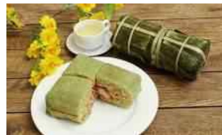
Bánh Chưng and Bánh Tét

Thịt Kho Tàu : "Meat Stewed in Coconut Juice", a traditional dish of pork belly and medium boiled eggs stewed overnight in a broth-like sauce, often eaten with pickled bean sprouts and chives and white rice.