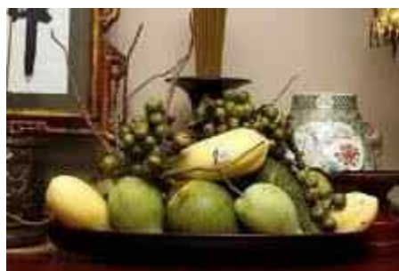
Fruit offering in the South include custard apples, coconuts, papayas, mango and goolar fig. In Vietnamese they are "Cầu, Dừa, Đủ, Xoài, Sung" which in the South literally is a prayer to "have enough to use" in the New Year.

Vietnamese families traditionally lay out a tray of 5 fruits at the altar called "Mâm Ngũ Quả". The fruits are colorful and meaningful. Asian mythology, the world is made of five basic elements: metal, wood, water, fire and earth. The plate of fruits on the family altar at New Year is one of the several ways to represent this concept. It also represents the desire for good crops and prosperity.