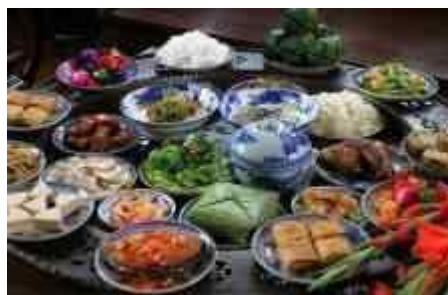
A typical meal offering to ancestors.

Vietnamese families traditionally lay out a tray of 5 fruits at the altar called "Mâm Ngũ Quả". The fruits are colorful and meaningful. Asian mythology, the world is made of five basic elements: metal, wood, water, fire and earth. The plate of fruits on the family altar at New Year is one of the several ways to represent this concept. It also represents the desire for good crops and prosperity.