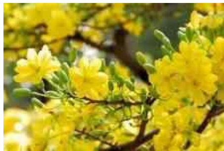
Hoa Mai (Ochna Integerrima)

Live, blooming flowers symbolize the rebirth that will take place in the coming spring and fruit blossoms symbolize the start of the cycle that will result in a new crop of fruit later in the year. These two distinct flowers are widely sold and purchased during Tết. The spectacular yellow flowers of the Hoa Mai ( Ochna integerrima ) make it very popular in southern Vietnam.