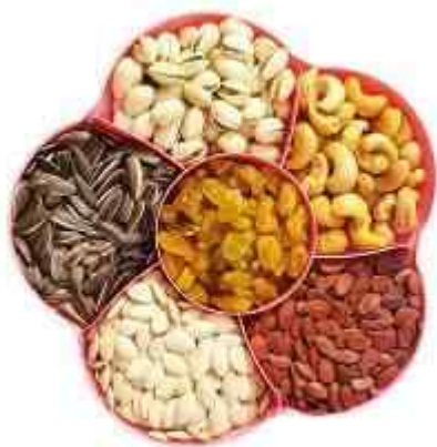
Hạt Dừa, Hạt Bì, Hạt Hướng Dương hạt điều, nho khô(roasted seeds).