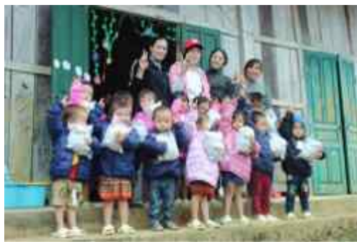
Santa Fe in the Community