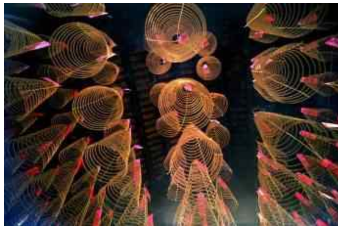
Burning incense in Chinese Temple District 5 (a piece of paper is attached to the incense; prayer writes name of the deceased or those who they are praying for).

Outdoor Entertainment will include lion dances, drum performances – the performances will take place in front of all major hotels in Dist. 1, (ie. Caravelle, Rex, Majestic, Grand, Continental, Kim Đô, Oscar, and Bông Sen, Palace Music, etc..) throughout February