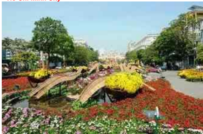
Flower Display on Nguyen Hue Street in Ho Chi Minh City

Youth Cultural House 27Jan to 16 Feb at 4 Pham Ngoc Thach – Dist. 1. Popular with locals especially on special occasions/holidays.