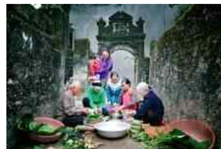
Preparing Bánh Chưng for Tet