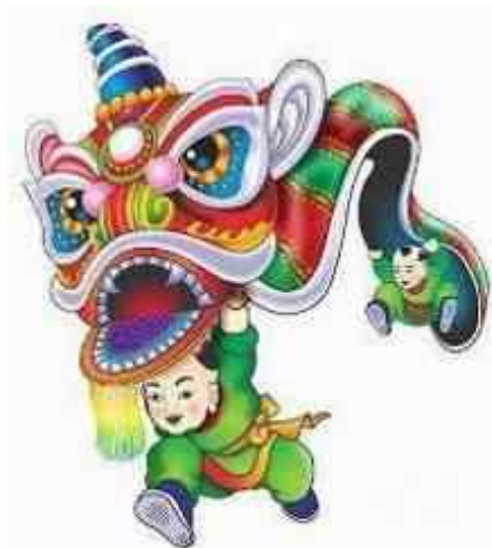
Events &amp; Activities (Hanoi &amp; Ho Chi Minh)