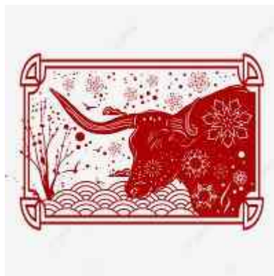
Year of The Ox - 2021