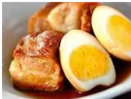
Thịt Kho Tàu (meat stewed in coconut juice)