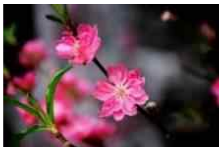
Hoa Đào (Peach Blossom)

Hoa Đào (peach blossom) is more common in the North as it can grow in the dry and cold weather. It is used to ward off evil spirits during the Tết celebrations.