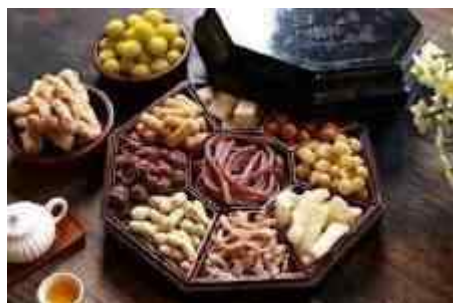
Mứt (dried fruit)