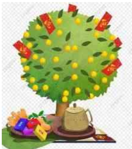
Cây Quất (Kumquat Tree)

Like a "family tree", the Kumquat plant symbolically represents the many generations of a household. The fruits are grandparents, the flowers are parents and the buds and green leaves are children. Kumquat plants are carefully selected for their symmetrical leaves, color and shape of fruit.