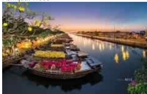
Ben Binh Dong Flower Market (open from 20 th of lunar December)

Similar to the pine tree for Christmas holiday in the West, Vietnamese also use many kinds of flowers and plants to decorate their homes for the holiday. Traditional plants include the Hoa Đào (Peach Blossom), Hoa Mai (Ochna Integerrima) and Cây Quất (Kumquat Tree). These plants represent coziness and prosperity. Other flowers may be displayed too.